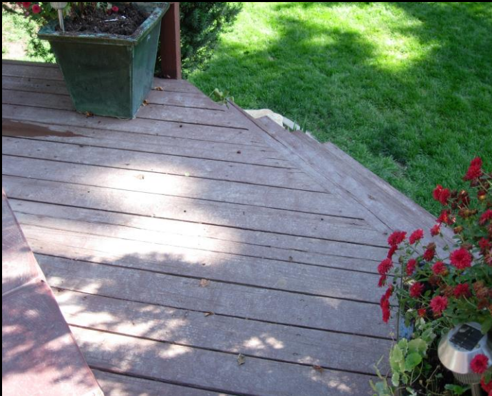
Taken 2009