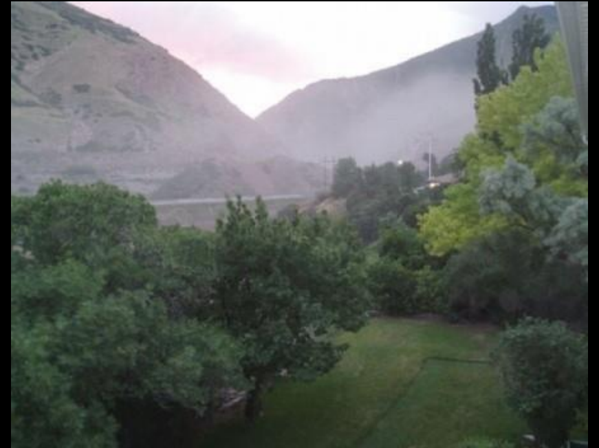
Taken July 2010