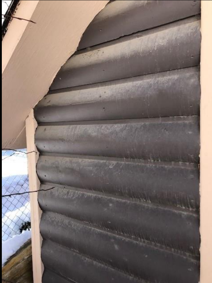
Taken December 18, 2021