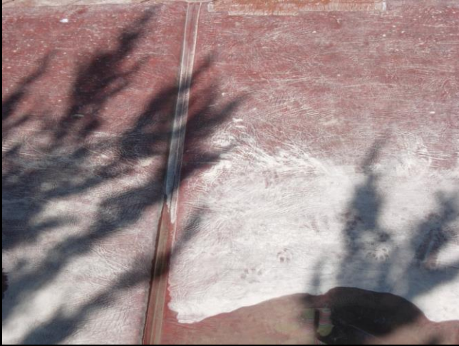
Taken 2009